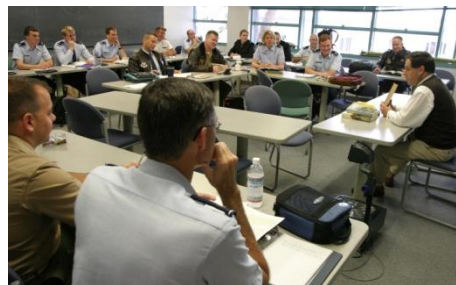
Students from NPS

Am I eligible and how do I enroll in courses?