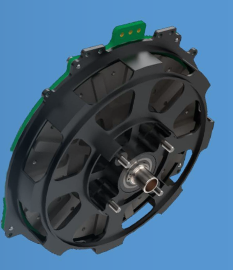
ECM propulsion motor for underwater vehicle