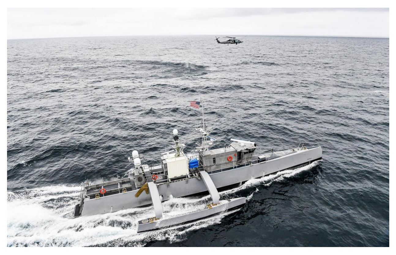
A Seahawk medium displacement unmanned surface vessel participates in U.S. Pacific Fleet's Unmanned Systems Integrated Battle Problem 21, 21 April 2021