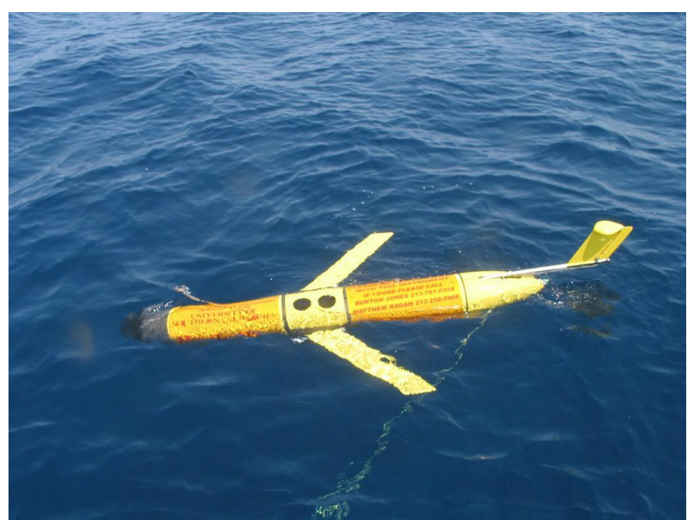
U.S. Navy Unmanned Buoyancy Glider<sup>8</sup>