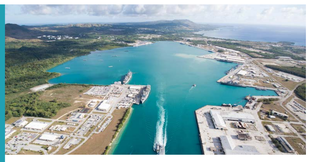
An aerial view of U.S. Naval Base Guam shows several Navy vessels moored in Apra Harbor.

Environmental security encompasses environmental change, human security, and national security. A nation-state becomes environmentally insecure when an environmental change is destructive enough to weaken the economy, political stability, quality or quantity of natural resources, and the status of military installations. The Energy Academic Group (EAG) is undergoing research to determine the value of incorporating environmental security into existing