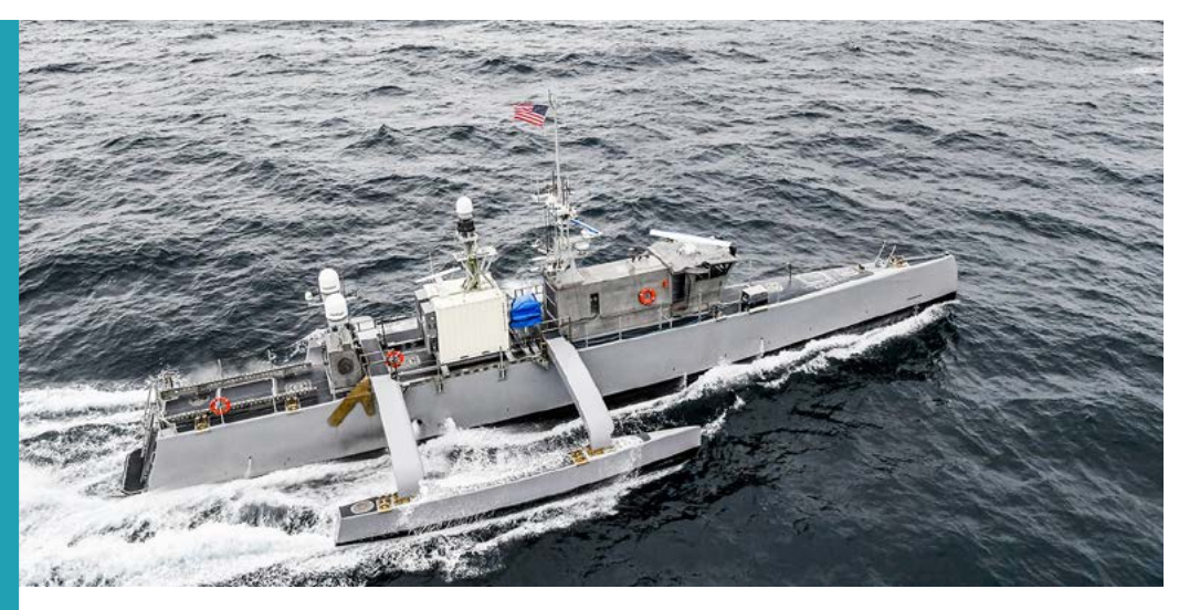
A Seahawk medium displacement unmanned surface vessel participates in U.S. Pacific Fleet's Unmanned Systems Integrated Battle Problem (UxS IBP) 21 on April 21, 2021.

This year, the Energy Academic Group (EAG) is undertaking an analysis of U.S. and international laws of autonomous systems supported by the Consortium for Robotics and Unmanned Systems Education and Research (CRUSER). This summer, research focused on the legal requirements for these systems to operate in international waters and exclusive economic zones (EEZs). This project contributes to Navy and DoD calls