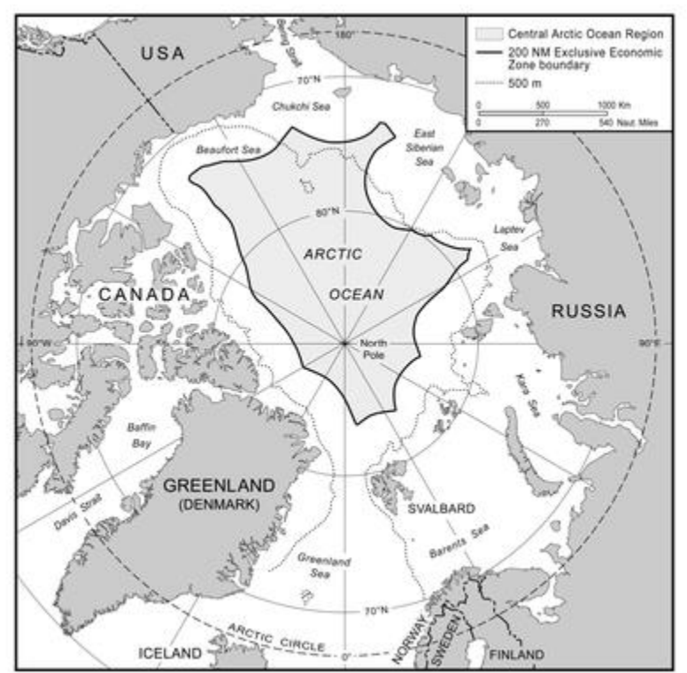
Figure 1: Map of central Arctic showing Exclusive Economic Zones (EEZs) and HE. region of the High Seas (shaded grey)