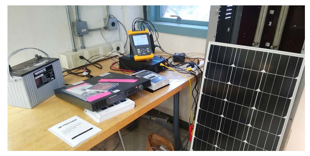
Hastily-Formed Microgrid project (HFM) utilizes commerical-off-shelf (COTS) components.

For more information on energy optimization efforts in the Air Force, visit: http://safie.hq.af. mil/OpEnergy