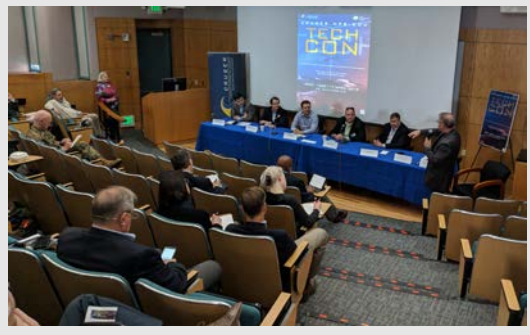
PANEL 2: The Entrepreneurs