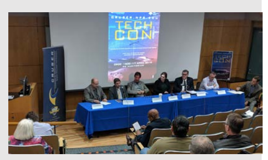
PANEL 3: NPS Research with Industry