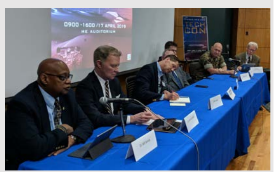
PANEL 1: Government Innovators