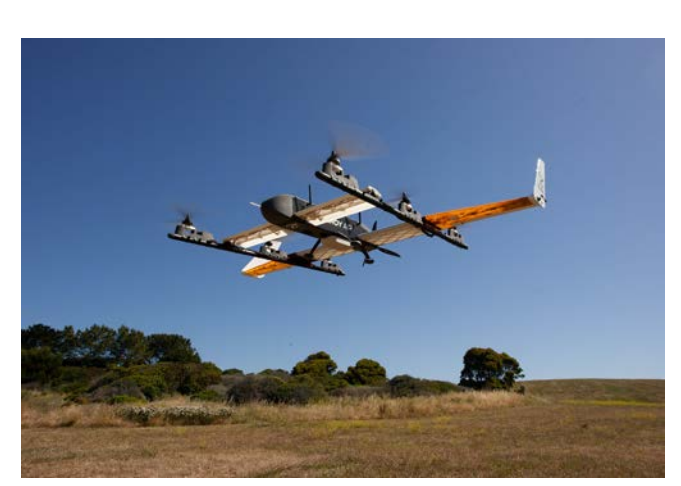
Experiment A-03: Elroy Air VTOL Aerial ULS: Sub-Scale Aircraft