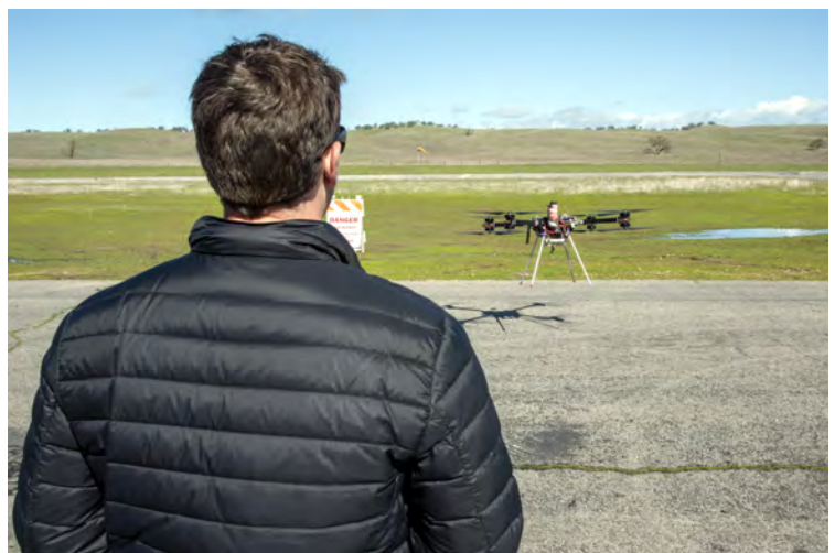
Naval Postgraduate School prototype of a proposed aerial delivery system called Snowflake-X