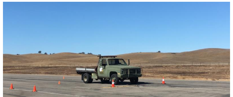
An MRAP and utility truck drive across ground sensors placed on the road as part of Carnegie Mellon University's Signal Extraction and Processing for sUAS Control Experiment. The Camp Roberts Regional Training Site - Maintenance provided the MRAP to participate in the experiment.