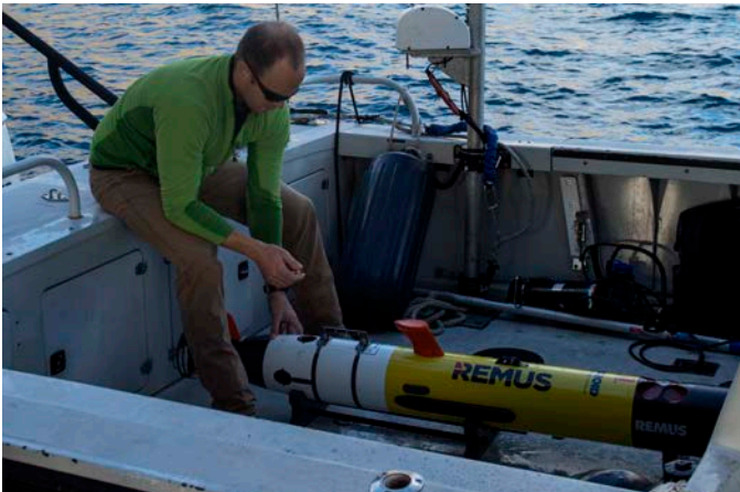
Clockwise from top left: (1) DDG 104, USS Sterett; (2) Technical Operations Center; (3) Sea Fox vehicle (4) REMUS vehicle, (5) Scan Eagle vehicle on the launcher.