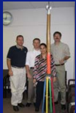
New SEM-PD21 Students

September brought both the beginning of a new SEM-PD21 Distance Learning cohort and the conclusion of a previous cohort, as graduates walked down the aisle in King Hall during the September 26 graduation ceremony at NPS.