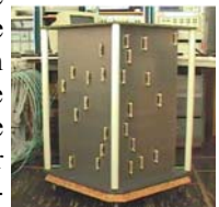
Receive Antenna Front View