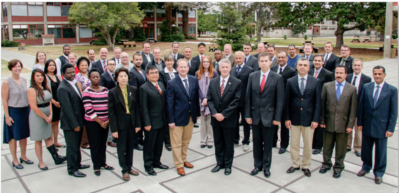
Class Photo: DRMC 14-4