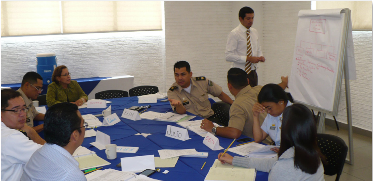
El Salvador MIDMC 2014