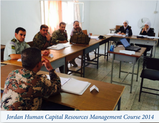
Jordan Human Capital Resources Management Course 2014