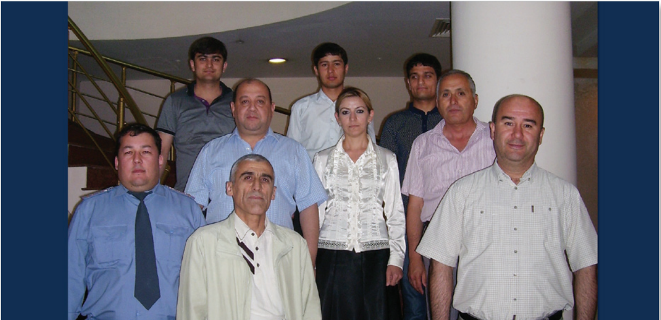
Tajikistan Defense Institution Building Workshop 2014