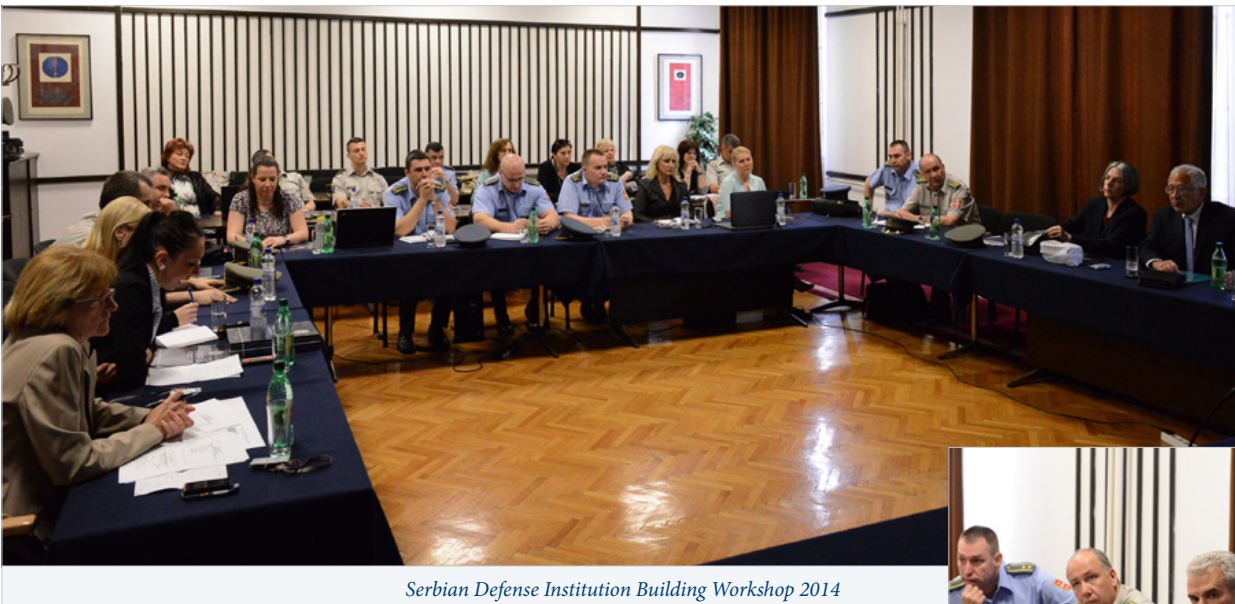
Serbian Defense Institution Building Workshop 2014