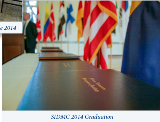
SIDMC 2014 Graduation