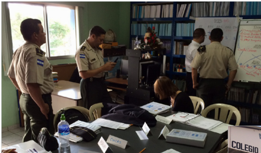
Honduras MIDMC 2014