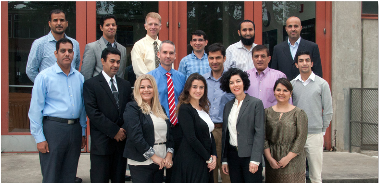
Class Photo: MCDM 14-2