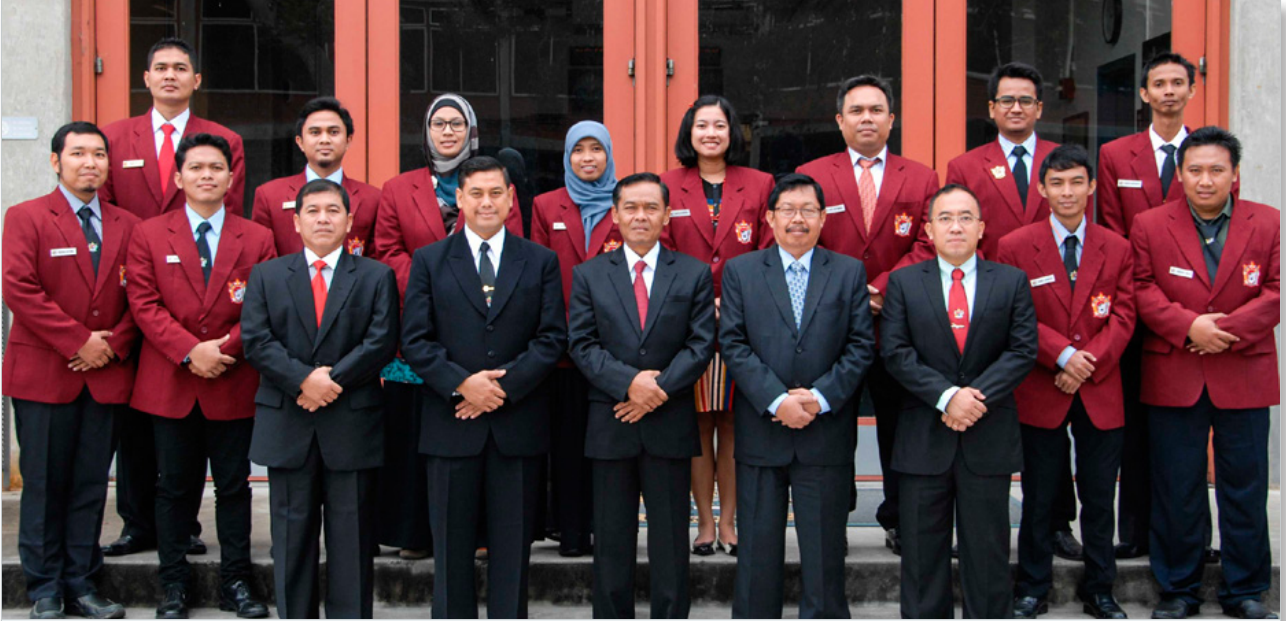
Class Photo: RIDMC Indonesia 2014