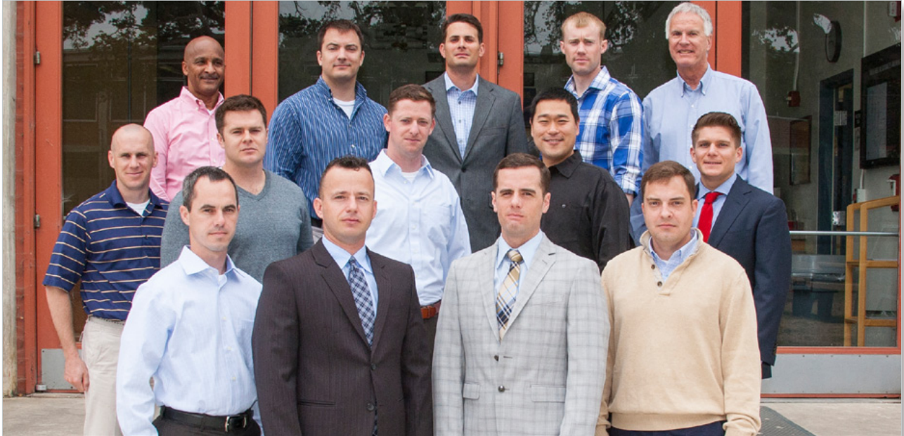
Class Photo: FAO 14-1