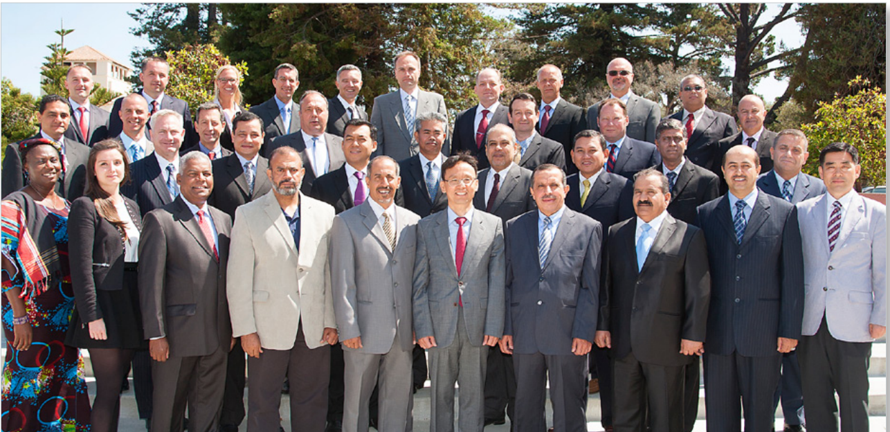
Class Photo: SIDMC 2014