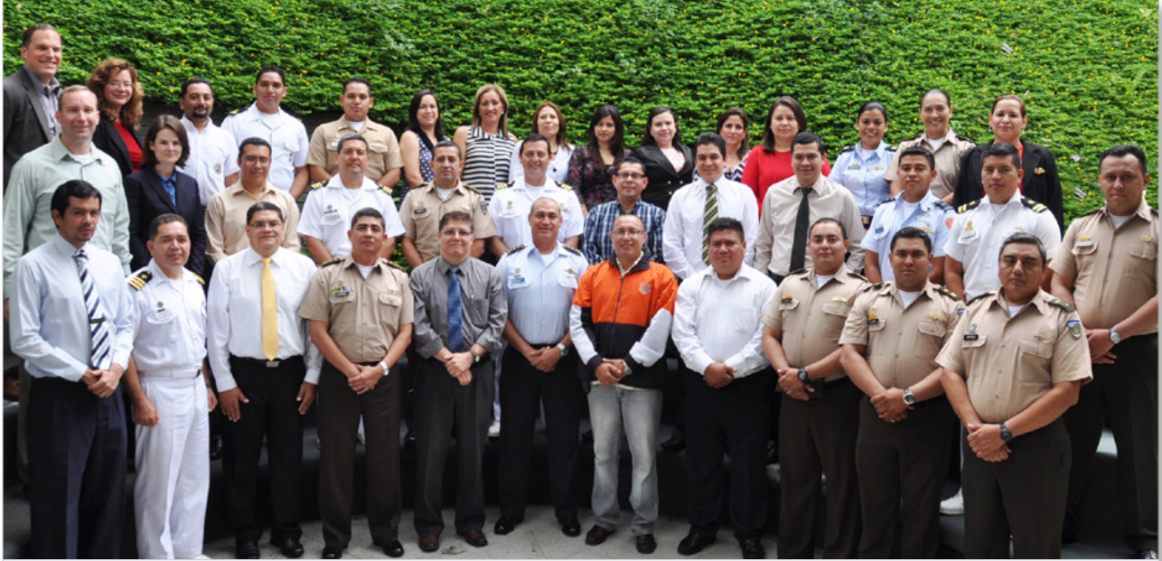
El Salvador MIDMC 2014