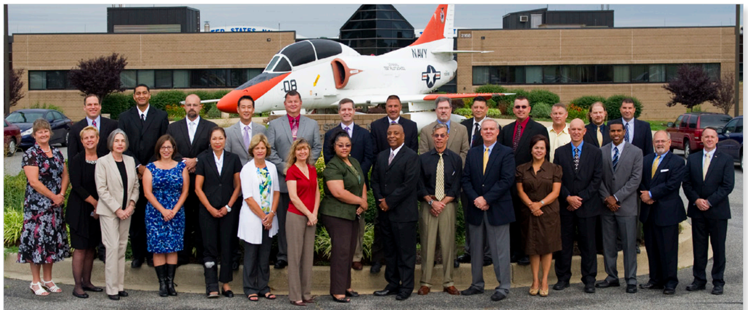
NAVAIR Leadership Development Program participants at Naval Air Station Patuxent River.

DRMI faculty conducted a Multiple-Criteria Decision Making Course from 14-25 July. The course included 16 participants from the United States, Colombia, Israel, Saudi Arabia, and Turkey. DRMI faculty provided lectures and case studies to develop the tools needed to address decision problems with many objectives, which are often conflicting. Participants applied the techniques to projects of their own choosing, based on issues faced within their own organizations, and presented their work to the class on the final day of the course.