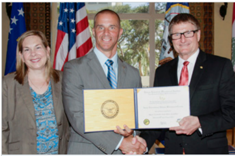
Major General Jean-Marc Lanthier, Canadian Army, at SIDMC graduation

DRMI concluded its 45 th annual Senior International Defense Management Course (SIDMC) on 28 August 2014. The SIDMC had 35 participants from the following 25 countries: Argentina, Canada, Colombia, Denmark, Egypt, Finland, Germany, Indonesia, Italy, Jordan, Kosovo, Lebanon, Liberia, Malaysia, Moldova, Poland, Qatar, Saudi Arabia, South Africa, South Korea, Sweden, Switzerland, Ukraine, the United Arab Emirates, and the United States. The SIDMC is for flag and general rank mili-