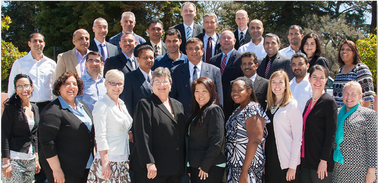
Class Photo: DRMC 14-3