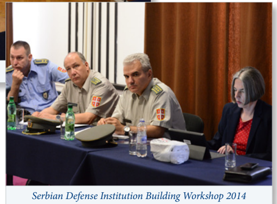
Serbian Defense Institution Building Workshop 2014