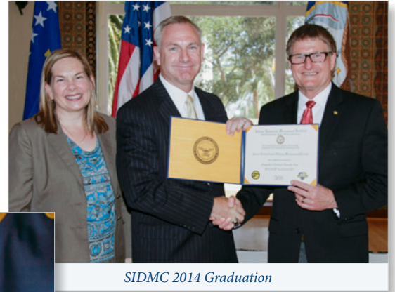
SIDMC 2014 Graduation