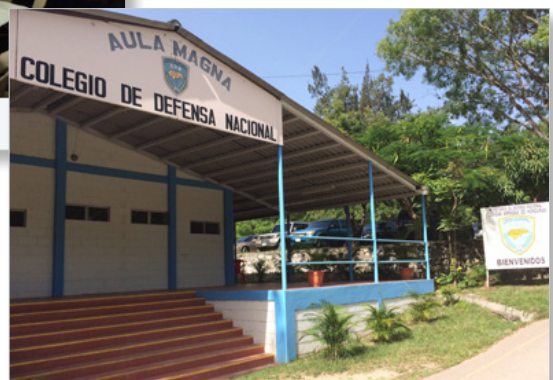
Honduras MIDMC 2014