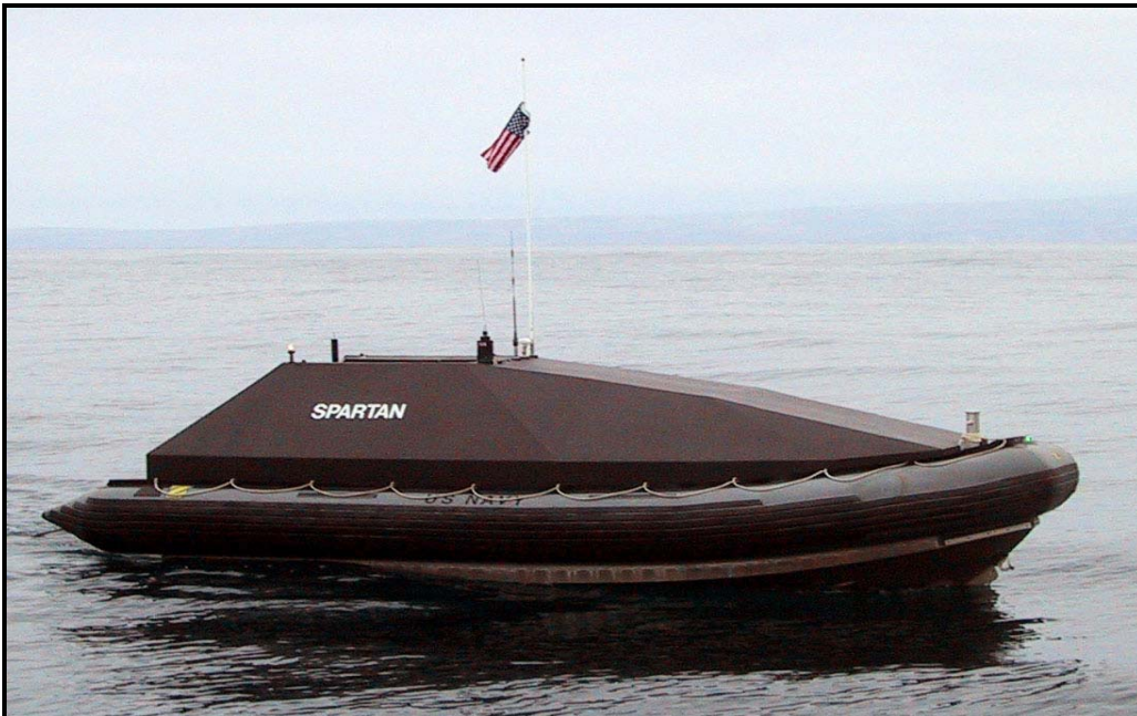
Figure 1. Spartan Scout Test Bed Model, NUWC, Newport, RI. 6

Spartan Scout is an evolving unmanned integrated sensor and weapon system (Figure 1) designed to be a primary force leveler against asymmetric threats by enabling the battleforce commander to match inexpensive threats with an appropriate response. As a low-cost force multiplier, Spartan provides increased sensor coverage in a net-centric environment, thus enabling the possibility of establishing battlespace dominance. 5