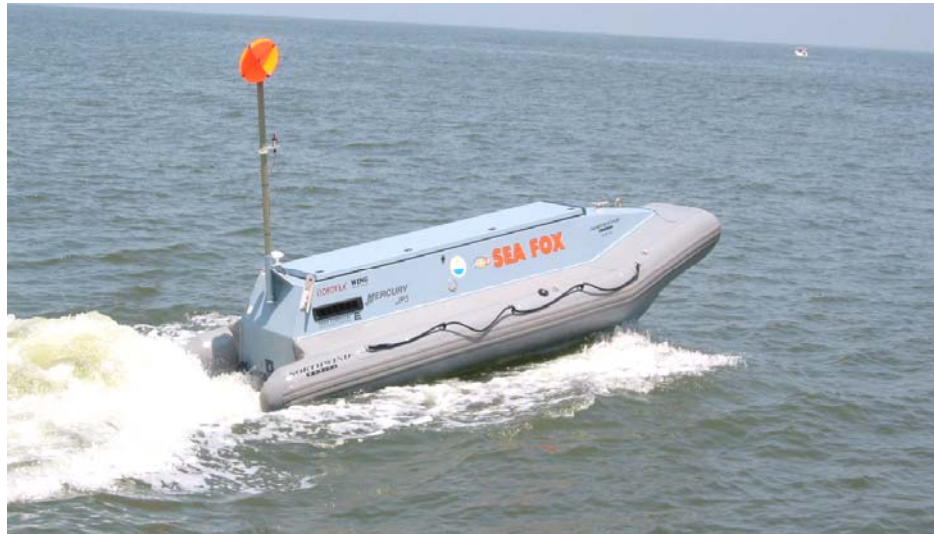
Figure 2. Sea Fox

video and infrared imagery to the ROS, thus allowing for standoff engagement of potential threats and increased situational awareness during Enhanced Maritime Interdiction Operations (EMIO) and VBSS missions.