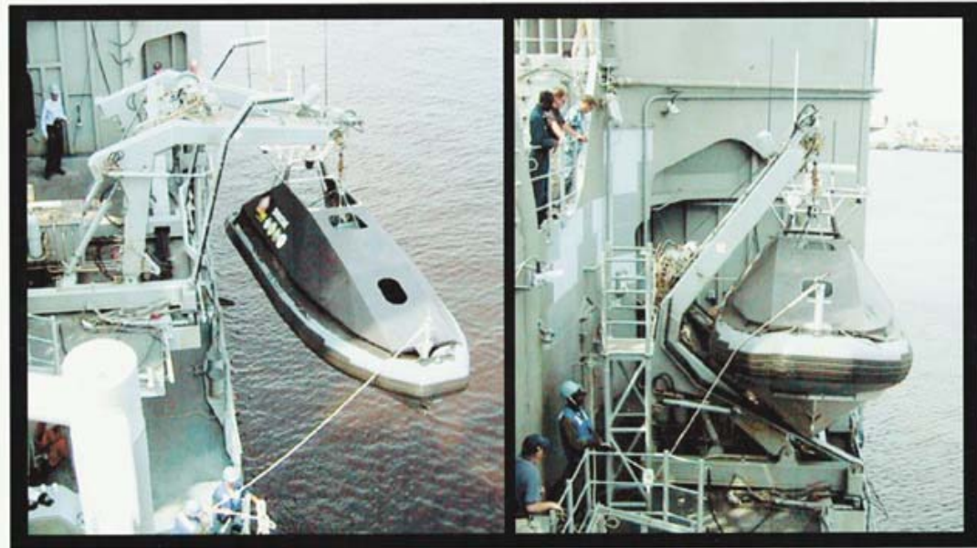
Figure 8. L & R of Spartan Scout aboard USS Gettysburg CG-64

USV deployment from USS Gettysburg and USS Pearl Harbor are clearly a case of a legacy L & R system used to support a new technology, unlike the L & R system for RMS aboard DDG 91-96, which require less people than what it takes to deploy its RHIB (see Table 4). The Spartan Scout ACTD projected spiral development plan does not address this concern, as illustrated in Table 6. USV introduction into the fleet should abide by the Navy's reduced manning initiatives. L & R is an area where manning could be reduced. Reduced manning L & R systems exist that could be incorporated into USV programs.