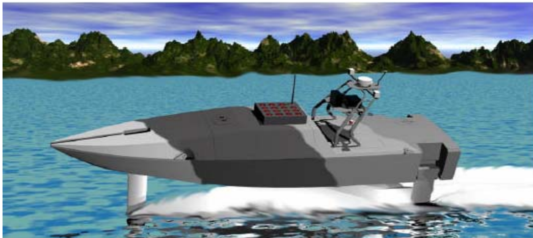
Figure 4. ONR's USSV Concept 11

One such USV is under development by the Navy's Office of Naval Research called the Unmanned Sea Surface Vehicle (USSV), depicted in Figure 4. Lessons learned from Spartan Scout are being incorporated into the USSV to develop a new hull form vehicle with a larger payload capacity, longer range and time on station. The USSV will meet interoperable requirements, i.e., is mission reconfigurable and fits with the modular, multi-functional family of platforms. One operator will be able to supervise several USVs at long range. Spartan Scout ACTD and Sea Fox fleet demonstrations are setting the groundwork for the advancement of USV technology and procedures that will enable USVs to operate safely in the vicinity of manned vessels.