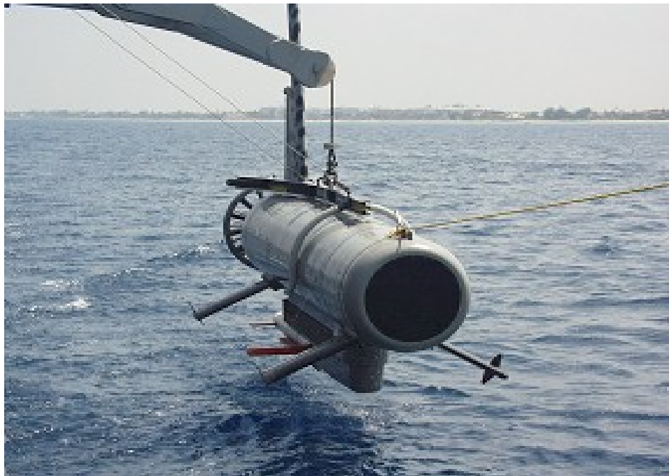
Figure 3. Remote Minehunting System's RMV 9

commands via a data link from the ship. Sonar data and streaming video from the vehicle's mast mounted camera are continuously transmitted to the ship.