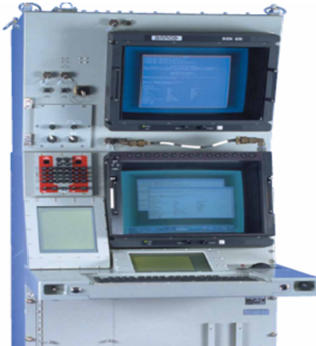
Figure 6. AN/UYQ-70 Console. 17

The operation of the RMS falls under pre-existing shipboard combat systems watch team organization for the MIW mission area. The operation is supervised by a qualified tactical action officer (TAO) and executed by the anti-surface warfare evaluator (ASWE) in the combat information center (CIC).