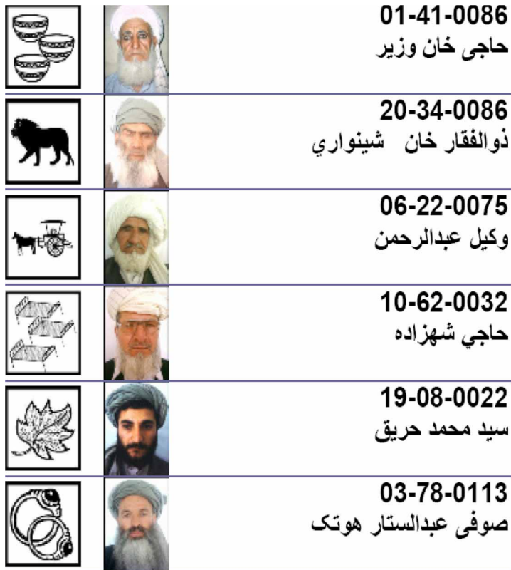
Figure A1. Example of a section of Afghan Legislative Election Ballot