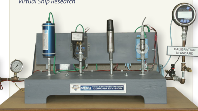
Virtual Ship Research