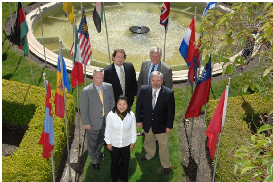
The Global Center Team

https://gcsc.rio-net.org http://www.nps.edu/Academics/Centers/GCSC