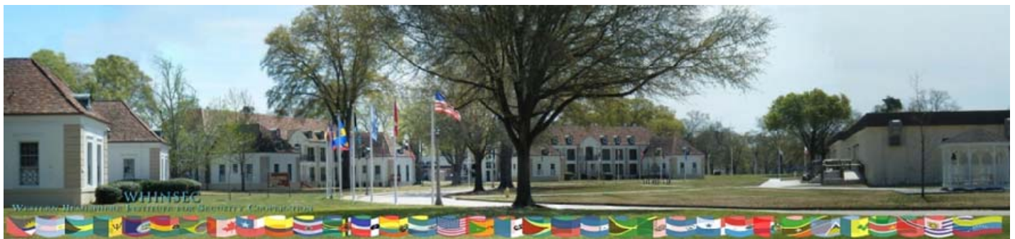
Current temporary campus of the Institute. In 2013, WHINSEC will relocate to a permanent home in the historic Fort Benning Station Hospital complex. The complex most recently housed the National Infantry Museum.

A subordinate of the U.S. Army Combined Arms Center, the Institute enjoys a reputation for excellence, both at home and abroad. The WHINSEC learning model supports U.S. interests and foreign policy objectives in the Western Hemisphere to ensure that students understand the necessity of doing the right thing, morally and ethically while accomplishing their missions. They complete one or two of the courses offered at the institute, each a professional, adult course of three to 49 weeks duration. All 19 resident and eight Mobile-Training-Team-taught courses offered by the Institute emphasize respect for human rights, the rule of law, due process,