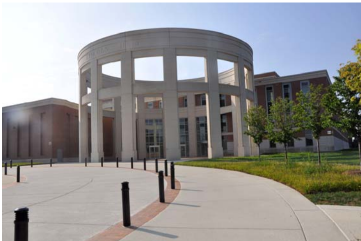
CHDS is located at the NDU, Abraham Lincoln Hall

CHDS also expanded outreach and research efforts in FY10 including televised video conferences, on-site seminars led by faculty members, focused new alumni association activities, and academic publications including the well-regarded Security and Defense Studies Review. Other enhanced publications in FY 10 include an Alumni Newsletter, post-event Occasional Papers and Regional Insights, which was established to use the Center's unique access to regional policy and opinion-makers to produce timely analysis of events and issues throughout the region.