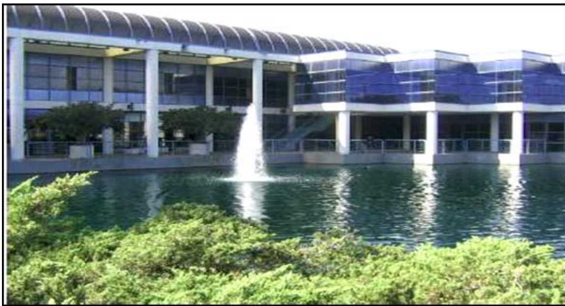
The Joint Special Operations University's facility at MacDill AFB, FL