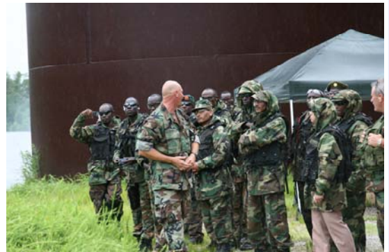
Students from various partner nations receive a briefing from a NAVSCIATTS instructor as part of their training during a recent SLSCCbT course

The school presently offers 13 formal courses of instruction in both Spanish and English at various times throughout the year while deploying MTTs around the globe. NAVSCIATTS has trained more than seven thousand students from about 70 partner nations.