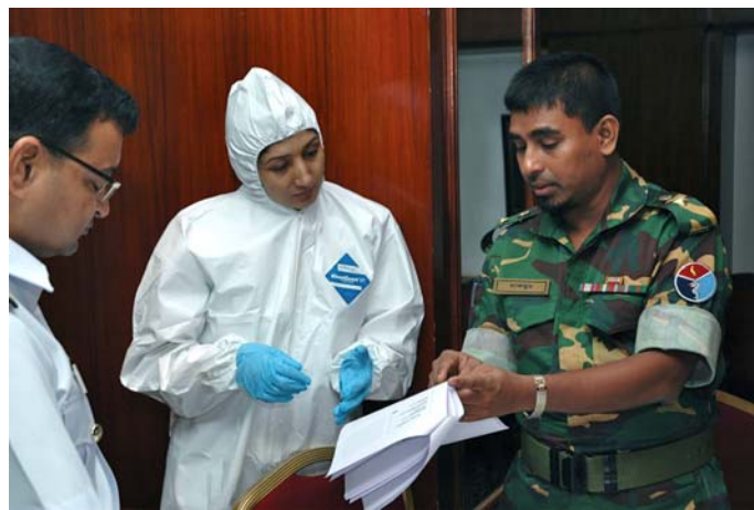
Participants study personnel protective measures at the COE-USAID Pandemic Influenza workshop, Dhaka, Bangladesh (October 2010)

COE was established in 1994 in Honolulu, Hawaii, USA by U.S. Congress as part of the Department of Defense under the auspices of Senator Daniel K. Inouye. Its mission is to assist the US military in improving its disaster management and humanitarian assistance capabilities through education and training programs, particularly in regard to the Asia-Pacific region. As such, COE works to improve relations between the US military and its foreign military and civilian counterparts, including host nations, and national and international governmental, non-governmental and international organizations. COE reports directly to the U.S. Pacific Command and receives policy guidance from the Assistant Secretary of Defense for Global Security Affairs.