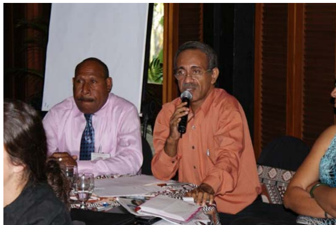
A discussion takes place at the health systems strengthening workshop in Nadi, Fiji

Finally, a series of workshops aimed at strengthening the public health capabilities of host nations was also launched for the first time. A multilateral workshop for South Asian countries was held in Nepal (July 2010) that focused on disaster healthcare workforce issues. Another workshop was held in Nadi, Fiji (September 2010) for the Oceania region, which focused on improving national public health systems to meet community needs in large-scale emergencies.