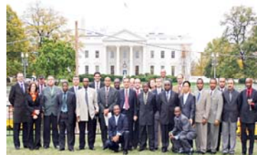
The PKRL Fall Class in Washington D.C.

Commenting on the value of the program, one student from an African nation stated that PKRL "is very useful and it exposes the student's to the concept of Peacekeeping Operations and the application of law in such operations. Also, the program affords foreign students the opportunity to learn more about American life and aspirations." The next PKRL (MASL P176019) will be offered again 13 April to 21 May 2009.