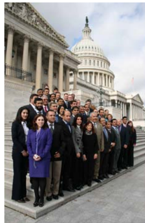
Executive Seminar participants

A three-day multinational workshop of security practitioners from select Pacific-rim nations on both sides of the Pacific Ocean will initiate dialogue, gain insights and develop mutual understanding of regional policies to manage global commons. It is co-hosted with the Center for Hemispheric Defense Studies (CHDS) and the Freeman Spogli Center at Stanford University.