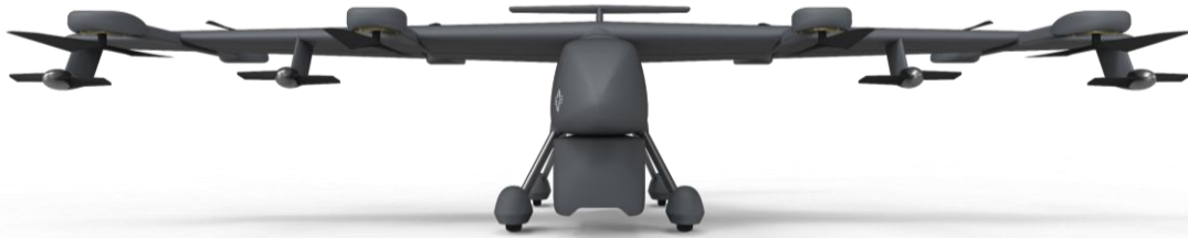
Autonomous Aerial Cargo System (render) - front view