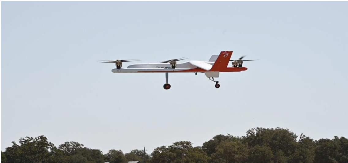
Full-scale demonstrator flight (prototype aircraft) at Camp Roberts - October 2019.